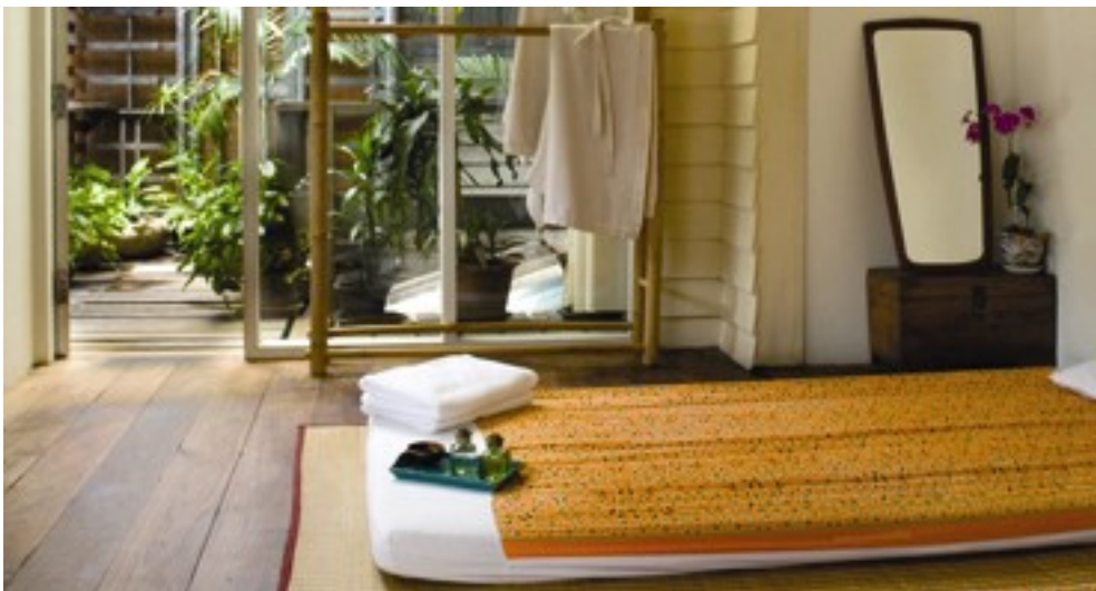
Performed on a floor mat, Thai massage encompasses acupressure, massage, and stretching.

herbal practice, nutrition, and spiritual meditation), Thai massage was originally passed from teacher to teacher within the Buddhist temples, while Thai families used it as a healing folk art. Unfortunately, much of the history of Thai massage was lost during the Burmese invasion of Thailand in 1767, although some of the traditions remain inscribed on the stone walls of the Wat