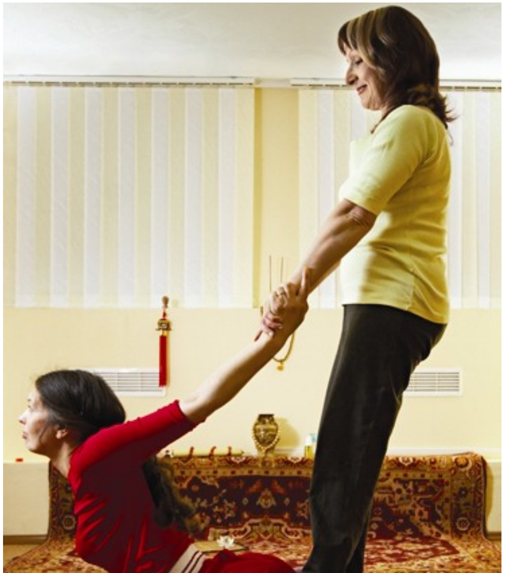
The therapist guides the client through the movements in a slow, flowing, yoga-type dance.

Young or old, healthy or frail, Thai massage offers something for everyone. Whether you're a weekend warrior needing to work out the aches and pains of excess, or a retiree needing to awaken and invigorate an aging body through movement and stretching, the therapeutic nature of Thai massage can address your needs.